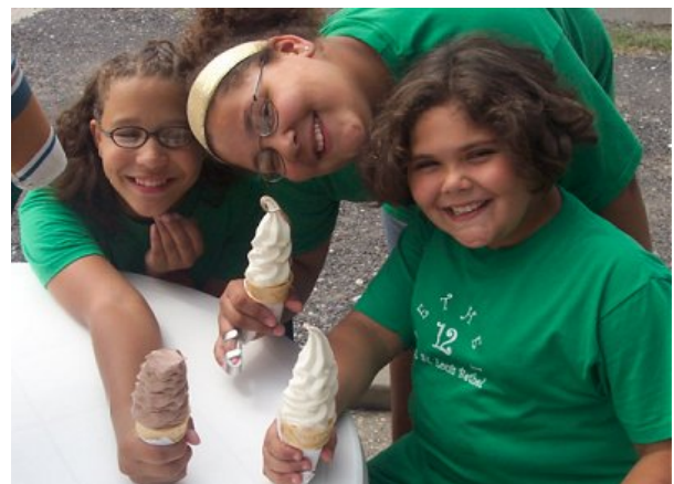
Yummy, ice cream!!