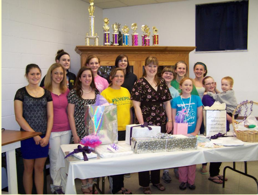
MOM AMY'S WEDDING SHOWER

Turn your “can’ts” into CANS and Your dreams into PLANS.